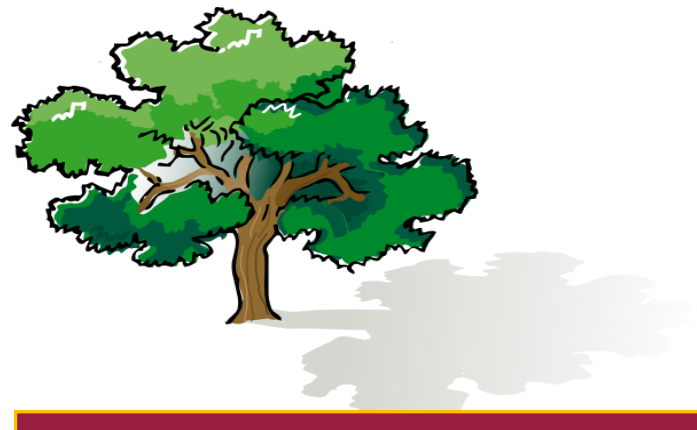
TELL YOUR FRIENDS ABOUT GGG

Neighbors of the properties were actively involved in the process where such concerns as the extended future use of the parcels was discussed. The City has committed to the proposition that the subject properties will never be used for any thing other than parks.